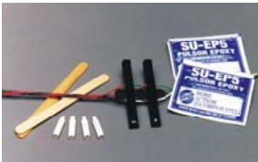
Standard Pulsor Enhanced Pulsor