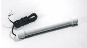
SU-P5050 Standard Probe